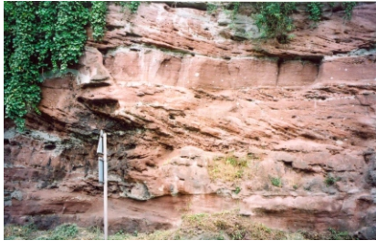
Old Red Sandstone cliffs Ross-on-Wye

To look after Herefordshire's special natural environment by conserving, enhancing and managing the county's geology and landscape diversity for the benefit of all.