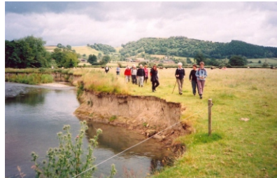
The Lugg near Byton

Augment/ upgrade county's Regionally Important Geological and Geomorphological Sites (RIGS)