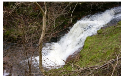
Waterfall in the Olchon Valley

Geodiversity means "the variety of rocks, fossils, minerals, landforms and soils along with the natural processes which shape the landscape." (English Nature 2004)