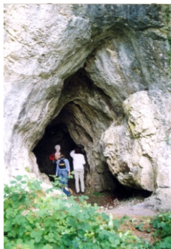
Carboniferous Crease Limestone King Arthur's Cave