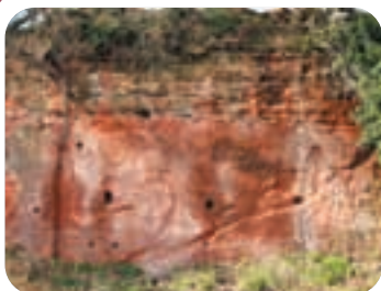
Martley. Brightly coloured orange-red sandstones of Triassic age.

This Plan identifies some of the objectives and actions to provide long term and sustainable support for the conservation of geodiversity within Worcestershire. It is not meant to be an exclusive list and it is hoped the Plan will evolve and grow. It aspires to be an incentive for interested groups and individuals to get involved and take action to